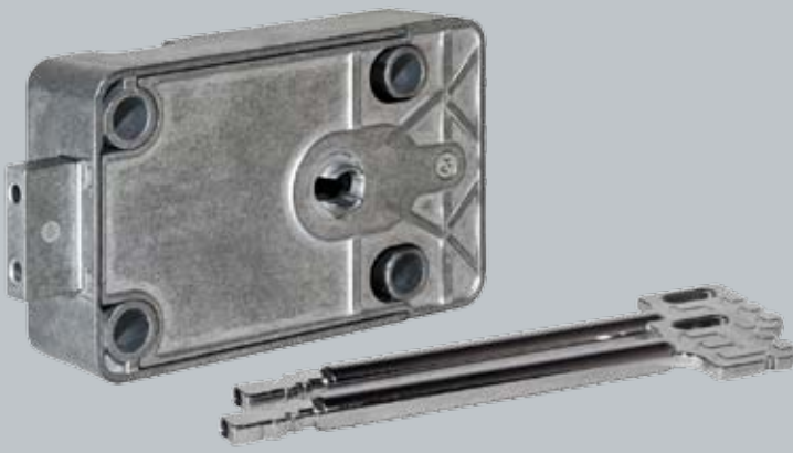
VAROS 70040 with user key